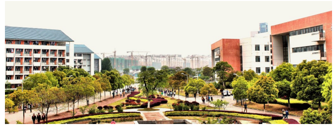
Nanjing Polytechnic Institute Campus