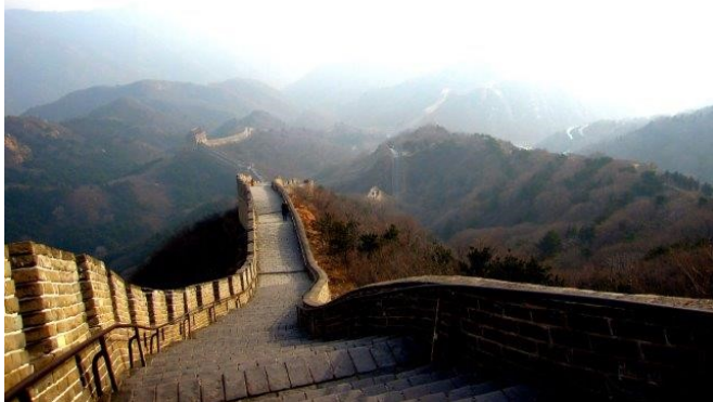
Great Wall near Beijing